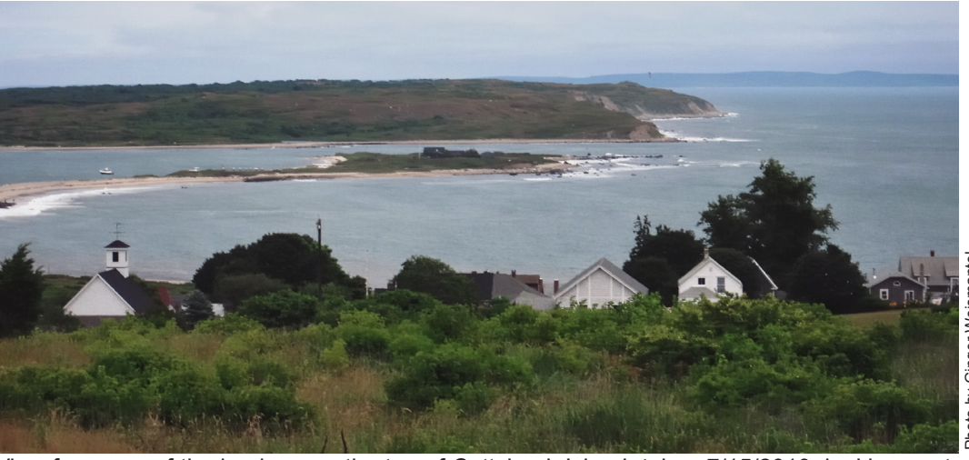
View from one of the bunkers on the top of Cuttyhunk Island, taken 7/15/2010, looking easterly across the sand spit at the eastern end of Cuttyhunk, across the Canapitsit Channel to Nashawena Island. The land visible in the distance is Martha's Vineyard, about 10 nm away.

[Ed. note: In my opinion, one of the world's grandest views is the sunset while sitting on the ruins of the WWII bunker at the top of Cuttyhunk Island. People usually applaud as the sun sinks into the water.]