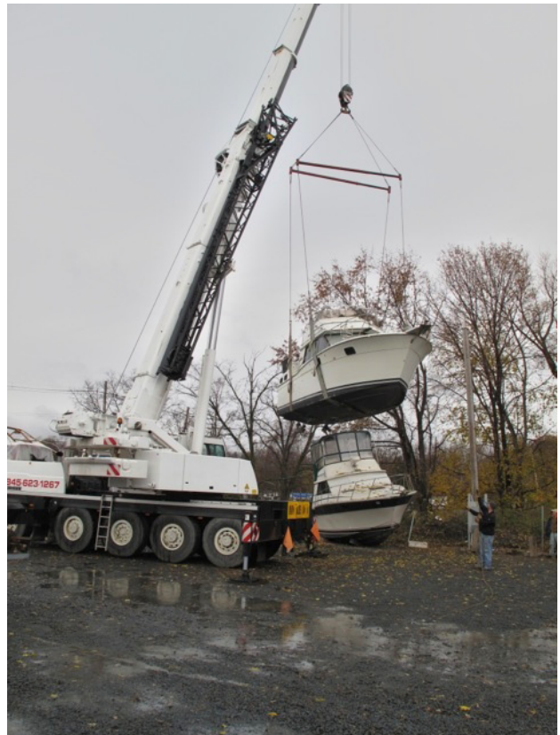
Crane lifting the boats after Hurricane Sandy.