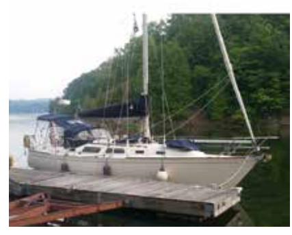
Carpathia at the Catskill Marina

The end of Summer 2017 was approaching and we still had not found the right window in our schedules to take an annual cruise. In early retirement we had cruised Carpathia , a Sabre-34 sloop with a six-ft draft and 51-