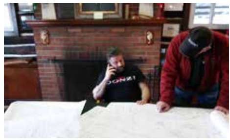
Work Boat