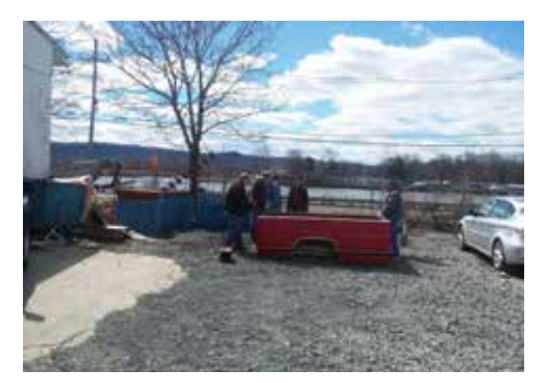
Circulators