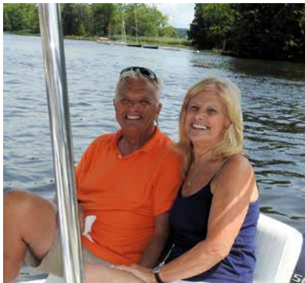
2017 ACBS Kingston show

I'm the type who never leaves a good job, because I kept that one for 12 years. In the boat yard, I helped to launch and pull the boats on that club's greased timber system. In 1962 at the outbreak of the Vietnam War, I enlisted in the Navy, following my older