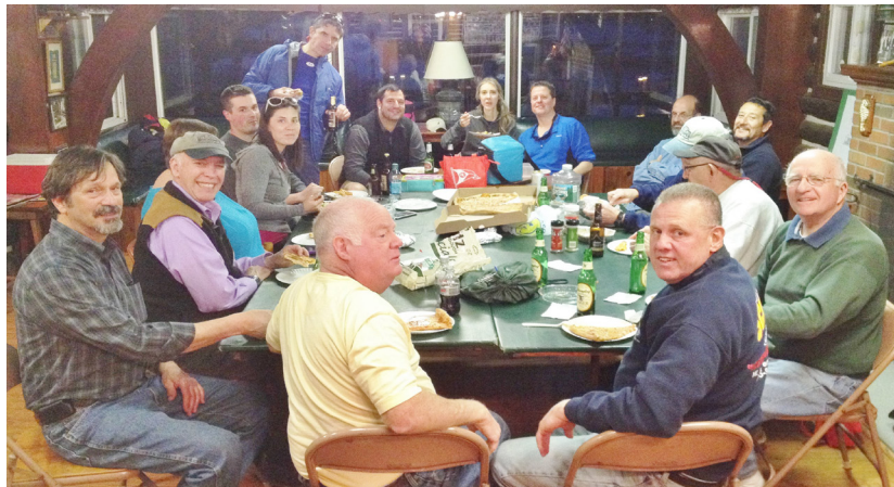
Sailors celebrating after the first HRYRA race of the spring season