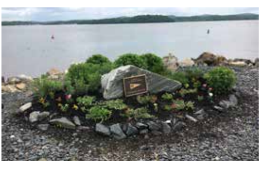
Awake, after a long winter nap!