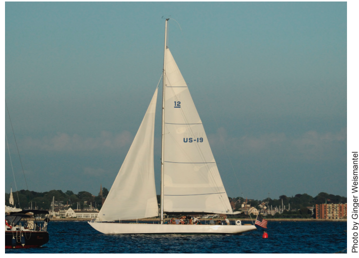
Typical view from a mooring at Conanicut Marina. This is Nefertiti , a 12-Metre, sailing by on August 19, 2008.

If anchoring out is your preference, go up the West Passage to Dutch Harbor, and dinghy into the Town Dock and walk about <sup>1</sup>/<sub>2</sub> to <sup>3</sup>/<sub>4</sub> mile to the same town and restaurants. (You are actually closer to the shopping center from the west side.) We love the quiet streets of Jamestown, and walking the side streets past the lovely homes of this quiet Island.