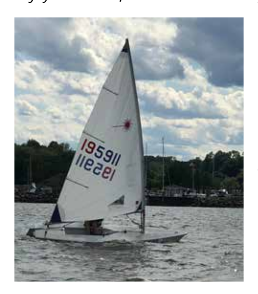
Laser Regatta Hosted at MYC

While Labor Day may have come and gone do not despair! Some of the best boating of the season is in September and early October. The views from the Hudson River in the fall are spectacular and I encourage you to take time to view the foliage. Enjoy the rest of the season.