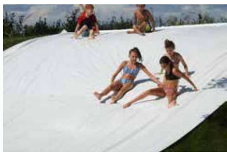
The water slide