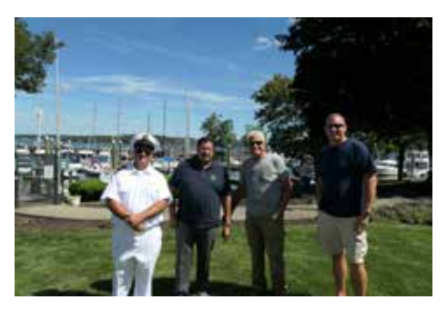
The Decommissioning Ceremony To honor the men and women who built and maintained the clubhouse for more than 72 years.