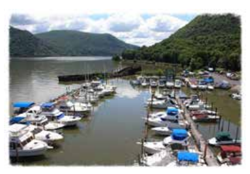
Croton Yacht Club looking south

Drinking in the majestic beauty of the river and being able to sail under the Bear Mountain Bridge past West Point and through Worlds End is a beautiful thing. West Point was strategically located because it's a good place to shoot at ships because the wind is fickle and this hasn't changed in 200 years. Many British revolutionary war sea captains were familiar with these treacherous waters and stayed away. Thankfully Andy and Karen avoided these perils of the past and arrived at Cornwall Yacht Club in just 3 1/2 hours! Normally this cruise would have taken well over four hours.