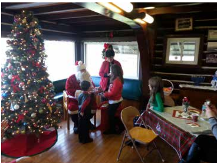
Santa Visits MYC Holiday Party