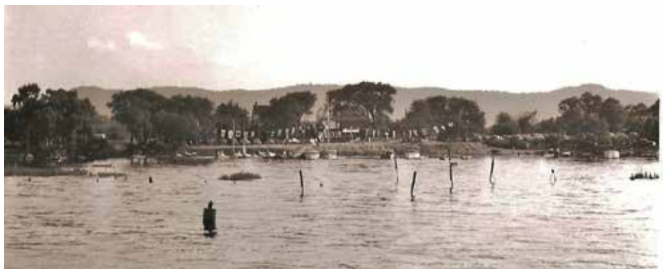
Below: Entering the Gap