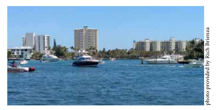
Boca Raton Inlet on March 17

To all our Associate Members, COME JOIN US! Volunteering on work weekend is one of the best ways to meet your neighbors, see how the club operates, and get some well needed exercise in under the guise of that four letter word..."work". I can't tell you the pride you will feel seeing the club transform from a winter state of hibernation to cleanly edged lawns, freshly mulched beds with new plantings and spruced up buildings. Seeing the picnic tables and grills set up on the dock patios and the few boats in the basin makes the season that much closer. Breakfast is served at 7am and lunch at 12 noon with an endless supply of coffee. All the good "comfort"