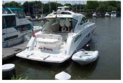
Fra Diavlo - Rich Brienza