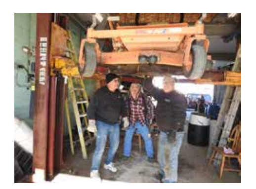
Snow Bird? Got Back Early!