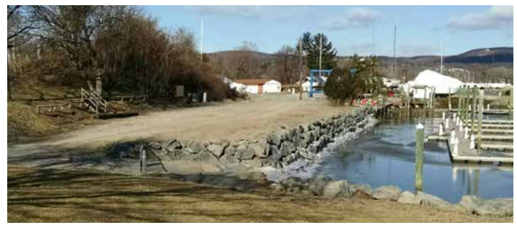
Dock 4 bulkhead and launch ramp project. Ready for final landscape and road work in the spring.

Also in February plans were made for the Cruising fleet winter cruise to Cape May, NJ the weekend of March 18-20. If you haven't attended one of these "cruises", they are always a lot of fun. The last trip to Cape May was well attended and everyone had a great time. If you plan on going, you