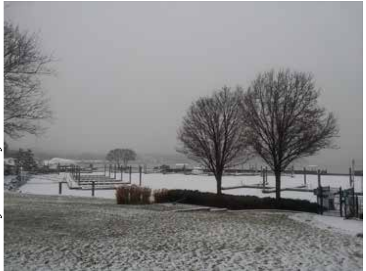
The Broken Gap Closure (taken from dock 6)